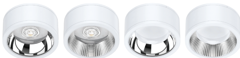
Lens + Specular Reflector